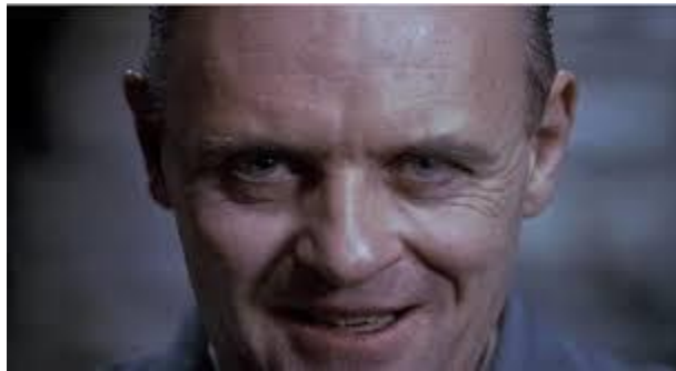
Anthony Hopkins, as Hannibal in The Silence of the Lambs .

Other tools used by actors are movement and gesture. Think about Anthony Hopkins, as Hannibal in The Silence of the Lambs : the way his eyes follow Clarice around, how his hands wave lightly to the music before he strikes, and his animalistic smile at the taste of human blood. All of these contribute to the audience's feelings toward the character. When you focus on the seemingly small details of an actor's movements, you can begin to understand even more about the film's purposes.