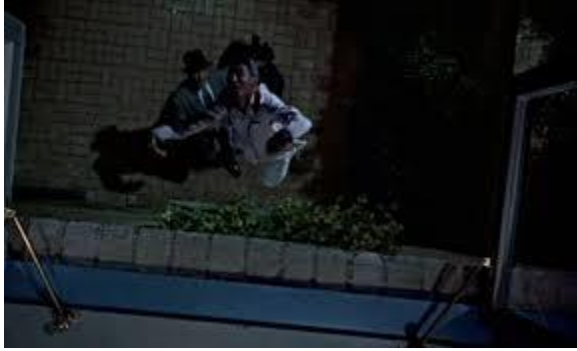
Rear Window (1954) by Alfred Hitchcock

A shot in which the audience sees an object straight on, in which the angle is even with the character or object, is called an eye-level shot. While this type of shot may not carry a lot of effect the first time it is used, think about what a director might be saying when a character that had been shot with a low-angle is now shown at eye-level: his strength and power may be weakening. Most shots used in movies are eye-level because it is the normal way that we see each other in real life.