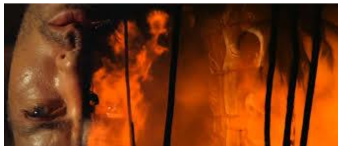
Apocalypse Now (1979) by Francis Ford Coppola