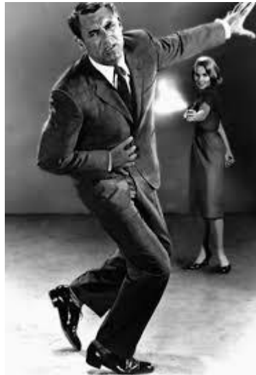
Alfred Hitchcock. North by Northwest

If an actor were framed in a long shot , we would see the actor’s entire body; objects in this type of framing would appear to be seen from some distance. Imagine a character on screen framed in a long shot. You probably could not make out many facial expressions or emotions, but think about what you could see: you can see the character’s surroundings. In a great scene from Alfred Hitchcock’s North by Northwest , a man who has been framed for murder is lured to an isolated cornfield, and Hitchcock frames the scene almost entirely in long shots to emphasize the man’s vulnerability and how out of place he is. In addition to showing the setting of a particular scene, long shots can also reveal distance or a lack of emotional connection between characters.