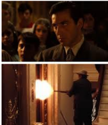
The Godfather (1972). Francis Ford Coppola

There are a number of reasons why an editor assembles his or her shots in a particular fashion. These reasons can include building suspense, making connections between scenes, and moving the story along at a particular flow and rhythm. One way that this is accomplished is through parallel editing , also called cross-cutting , which is used to cut between scenes that are happening simultaneously but not in the same location. When the damsel in distress is tied to the railroad tracks, the film cuts from the damsel to the oncoming train, then to the hero on his way, then back to the damsel, and so on. The question, stated without a single word, is “Will the hero make it in time?” This use of parallel editing obviously builds suspense. Other reasons for parallel editing are to make connections between events for thematic purposes. At the end of The Godfather , for example, Michael Corleone is seen attending the baptism of his godson. The editor cuts from the church to scenes of assassination; throughout the country Michael’s rivals are being killed at the same time. We see Michael renouncing “evil” at the same time that his henchmen are killing in his name. By connecting these images through parallel editing, we are shown Michael’s baptism of violence as the new godfather.