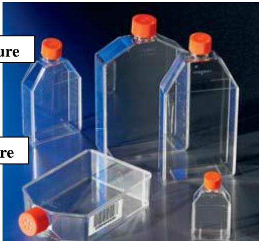
Microplaques de culture