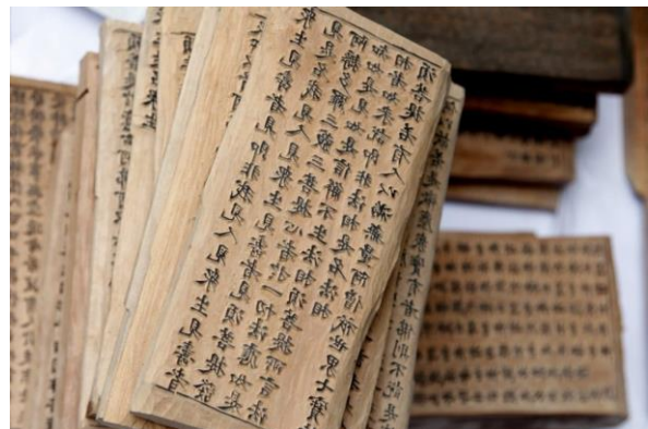
The Chinese Printing