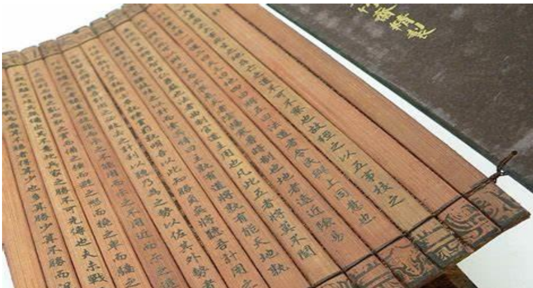
Figure 01 : Chinese Bamboo

Paper made from silk thus became the first luxury paper. Evidence of writing on silk from that time was found in the tomb of a marquise who died around 168 in Mawangdui (Hunan). The material was certainly more expensive, but also more practical than bamboo.