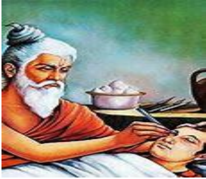
Sushruta (The father of Plastic Surgery)