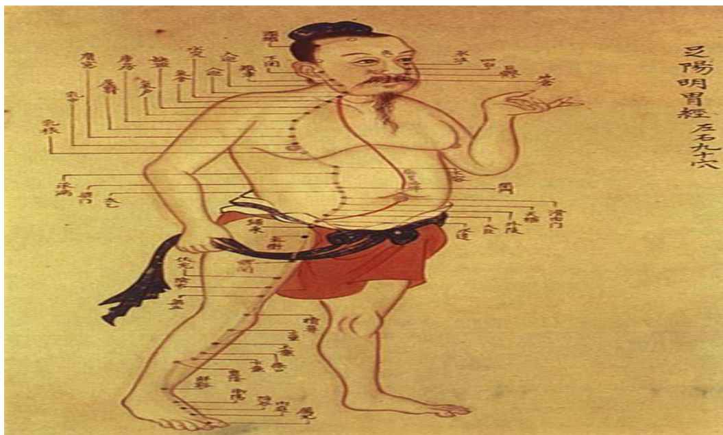
Figure 02 : The Ancient Chinese Medicine

The practice of Acupuncture is one of the specific aspects of Chinese medicine.