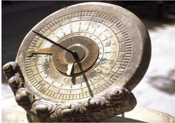
The mechanical Watch making