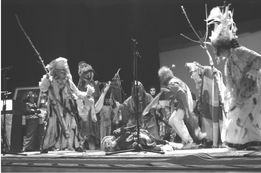
Ayrad – Bni Snus

leqruh, ssawađent-ay-d timusniwin yemxallafen icudden s amezruy, yer tmetti, yer tzuri, tawennađt, d ugama ideg yettæici umdan.