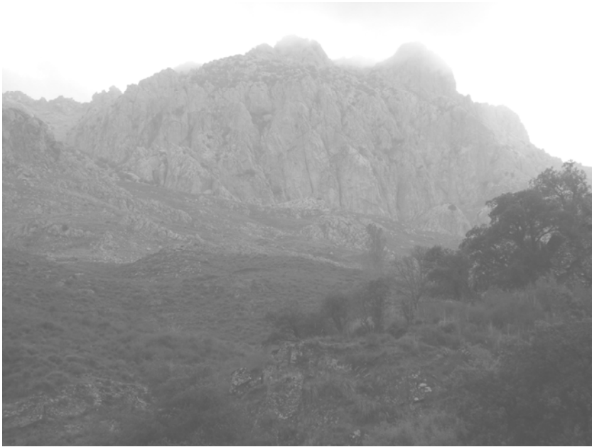
Aerqub, Tigemmuniin, At Wasif

Awalen imezwura n yismawen n tamiwin yettwazedyen di tuget ttwaksen-d seg yismawen n udrar, n waman, n yimyi, n tnezduyt, n wussan, n umdan.