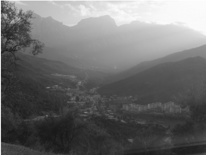
Larebea n At Wasif

Ismawen n tamiwin yettwazedyen n tmurt n Leqbayel gten akken gten leşnaf n wakal n tmurt-is. Yal isem izzuyur deffir-s amezruy n yimezday-is.