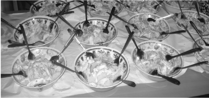
Imensi n yennayer : seksu s uyaziḍ

Azmul n yennayer d azmul lqayen di leɛwayed tiqburin n yimaziyen. Iseggasen-agi ineggura di tmurt-nney, imi i d-yella fell-as aṭas n leqdic d unadi, yufrar-d, iban-d belli ilaq ad yili d ass ayelnaw am wussan n lficṭat nniḍen tiyelnawin. Nessaram ad yuyal umezwaru n yennayer d ass n leid tayelnawt di Lezzayer.