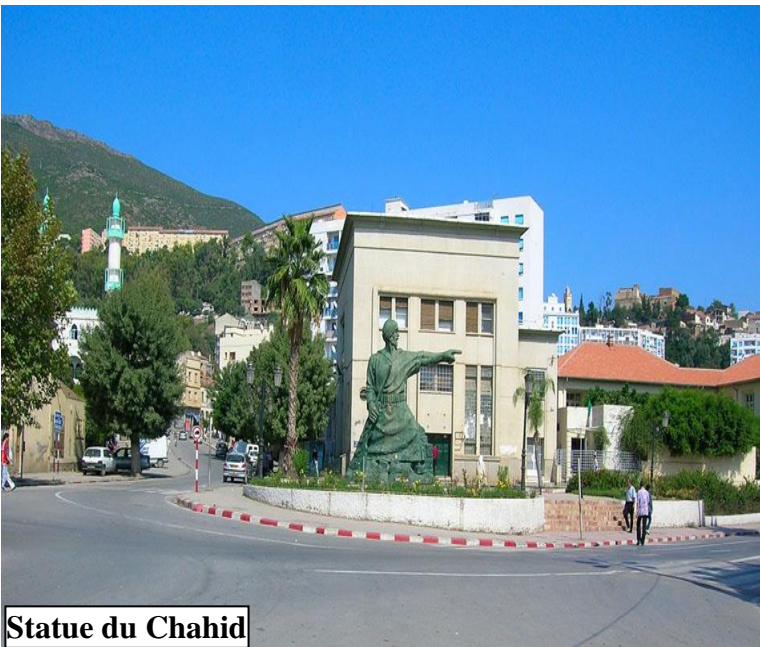
Statue du Chahid