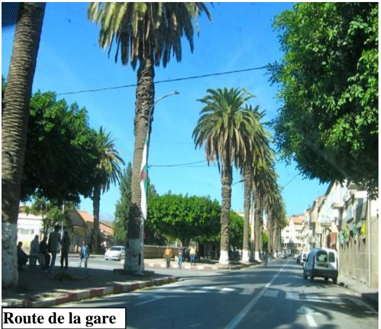
Route de la gare