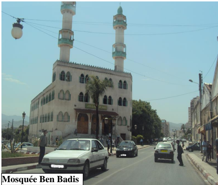
Mosquée Ben Badis