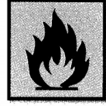
f fire hazards

All these things contribute to a bad working environment . The government sends officials called health and safety inspectors to make sure that factories and offices are safe places to work. They check what companies are doing about things like: