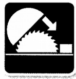
d dangerous machinery