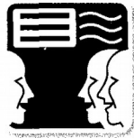
g heating and air-conditioning

All these things contribute to a bad working environment . The government sends officials called health and safety inspectors to make sure that factories and offices are safe places to work. They check what companies are doing about things like: