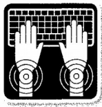
c repetitive strain injury or RSI