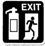
i fire precautions