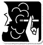
b passive smoking