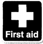
h first aid